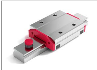
Plastic plugs for sealing the attachment holes

Plastic plugs in the guideway attachment holes prevent accumulations of dirt.