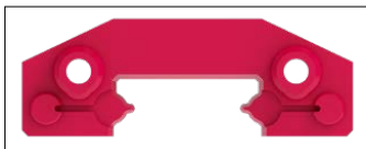
Clearance wiper (AS)

The wiper brushes across guideway surfaces and tracks and provides optimal protection against contamination.